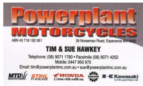
Tim & Sue Hawkey at Power Plant